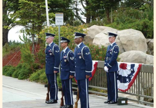
Above: A standing room only event hosted the 2011 Annual Memorial Day Service. The service continued outside with the Air Force Color Guard.