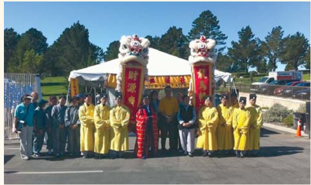
Above: Our annual Ching Ming event – 2011